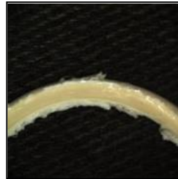
Incumbent FFKM Poppet Seal