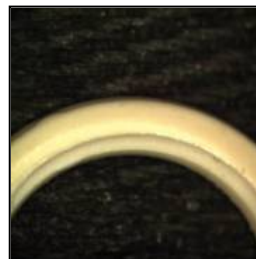
Incumbent FFKM Top Nozzle Seal