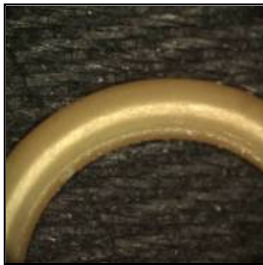
Kalrez® 9100 Top Nozzle Seal