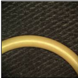
Kalrez® 9100 Poppet Seal

Figure 2. DuPont™ Kalrez® 9100 and incumbent seals after processing 5000 wafers. It was the research center's opinion that the Kalrez® 9100 seals could have continued to function beyond the scheduled PM cycle of 5,000 wafers.